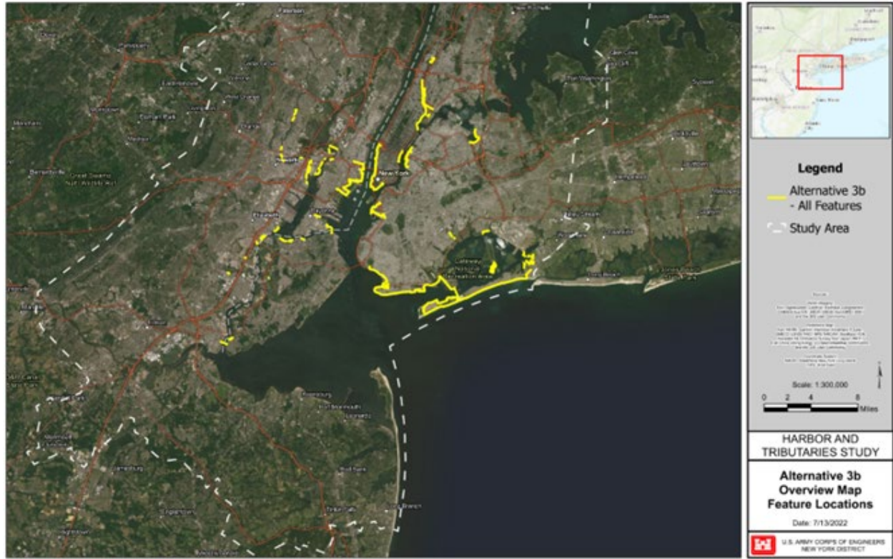
Figure 23-2. NYNJHAT Study Tentatively Selected Plan