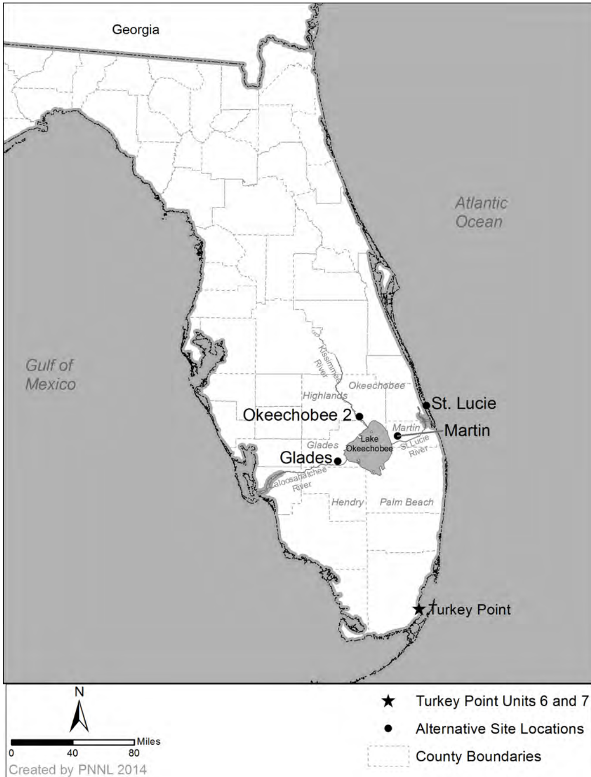
Figure ES-2. Location of Sites Considered as Alternatives to the Turkey Point Site