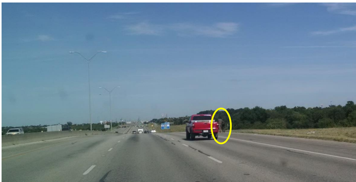
Figure 2. Intentional Pedestrian Walking a Bicycle on I-37.