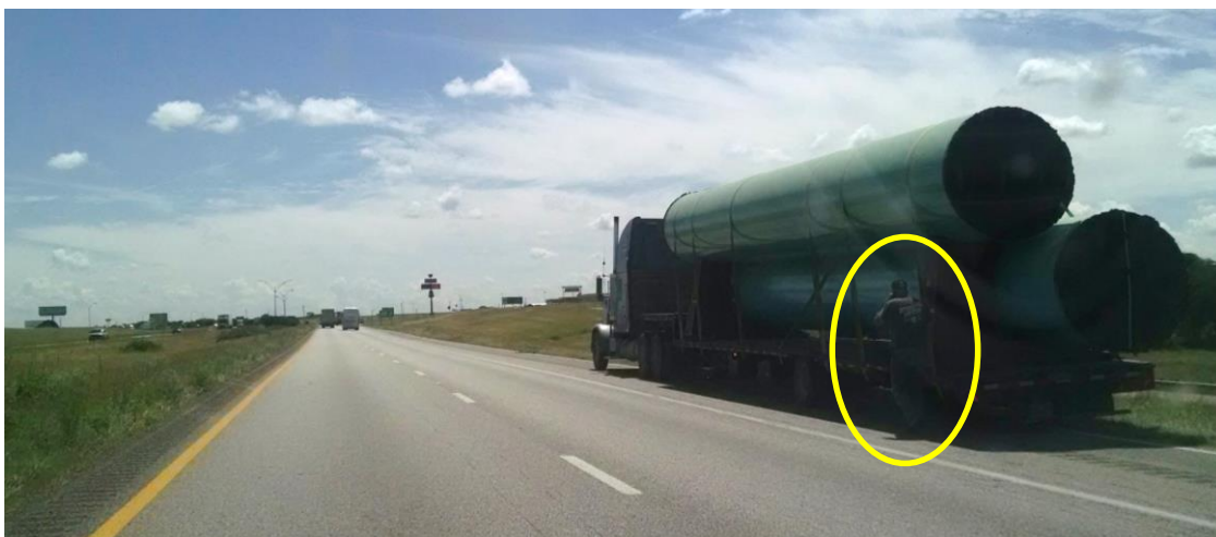
Figure 4. Unintended Pedestrian Walking around Truck (Source: Joan Hudson).

As stated above, more than one-third of pedestrian fatalities occurring on interstates involve unintended pedestrians. One possible reason that an unintended pedestrian would be present on the interstate is because of a disabled vehicle (PEDSAFE, 2014).