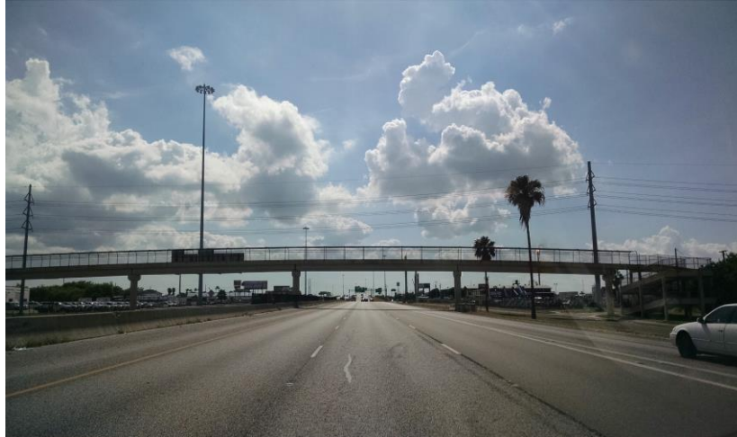
Figure 6. Example of Pedestrian Overpass.