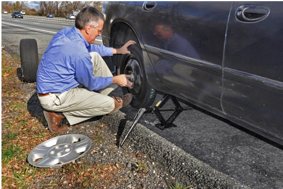
Figure 3. Unintended Pedestrian Repairs Tire along Roadside (Source: TTI Communications).

Unintended pedestrians refer to persons who exit a vehicle on the roadway, such as when repairing a flat tire on the roadside, assisting another stranded motorist, or being involved in a crash (see Figure 3 and Figure 4). Previous studies found that over one-third of the pedestrian fatalities on interstates involve unintended pedestrians and half involve intentional pedestrians (Johnson, 1997; Istre et al., 2007). In many cases, the reason the pedestrian was on the highway was unknown.