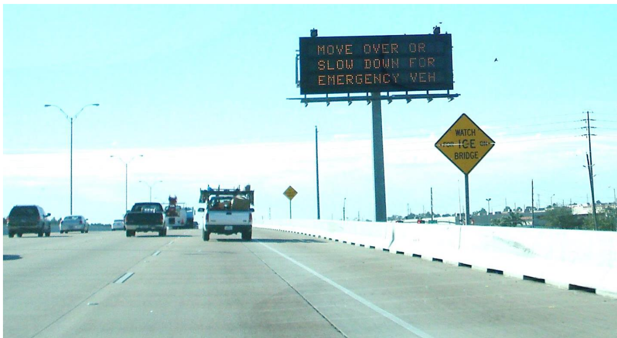
Figure 8. A TxDOT Variable Message Sign Instructing Drivers to Move Over or Slow Down for Emergency Vehicles on the Sam Houston Beltway in Houston, Texas (Bierling and Li, 2009).

TxDOT displays messages about moving over or slowing down on dynamic message signs, as shown in Figure 8.