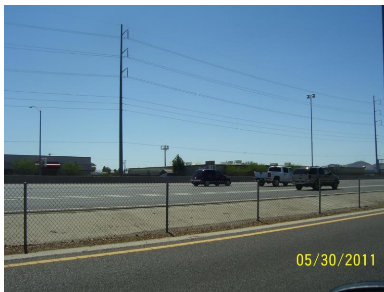
Figure 5. Example of Chain Link Fence Barrier along Main Lanes (Source: Will Bozeman).