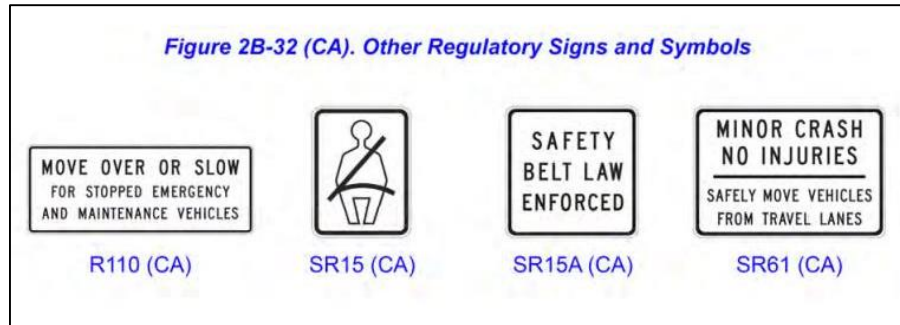
Figure 7. California DOT Move Over Signs.

TxDOT displays messages about moving over or slowing down on dynamic message signs, as shown in Figure 8.