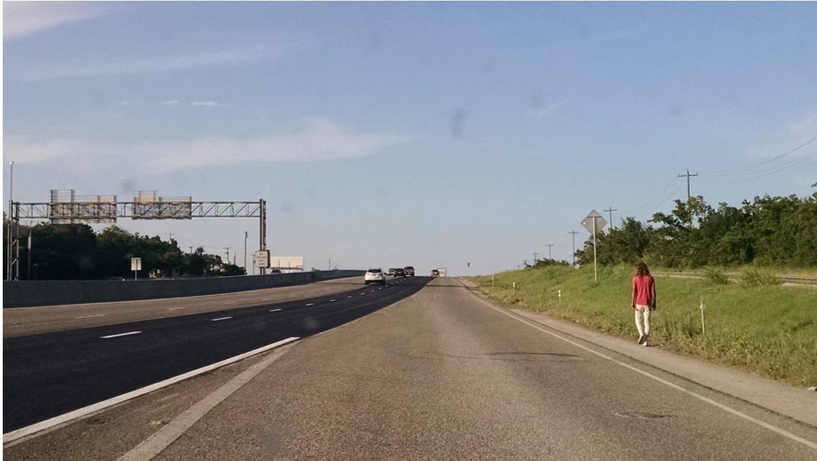
Figure 1. Intentional Pedestrian Walking on I-35.

Johnson (1997) defined pedestrians involved in crashes on high-speed roadways in two categories: intentional pedestrians and unintended pedestrians (Johnson, 1997; Istre et al., 2007). Intentional pedestrians refer to persons entering controlled-access, high-speed roadways on purpose, such as crossing the interstate as a shortcut to destinations. See Figure 1 and Figure 2 for examples of intentional pedestrians.